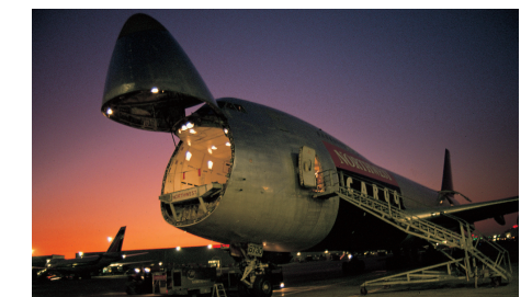
Airport Logistics Operations

Nishitetsu's international logistics operations are spread across 24 countries and regions. Centrally operated branches are established in each country of operations in order to quickly evaluate various situations and provide services that gain the trust in their respective region. Efforts are being made to strengthen our global network.