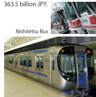
Tenjin Omuta Line

Nishitetsu's sales have grown in the housing and international logistics business operations, etc. on top of its bus and railroad business operations. The Nishitetsu Group's consolidated revenue has grown to 363.5 billion JPY.